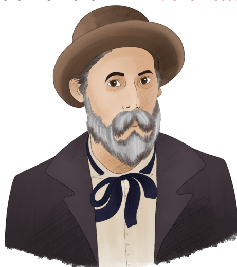
Illustration: @studio Ocarina

More information in www.renoir-essoyes.fr